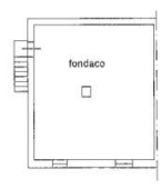
Piano sottostrada 1 H = 2,20